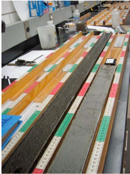
Figure 3. Split cores ready for initial core description on the core table

multi-sensor core logging equipment to acquire digitized core data. He also attempted to do the initial visual core description as a real geologist on the core table (Figure 3).