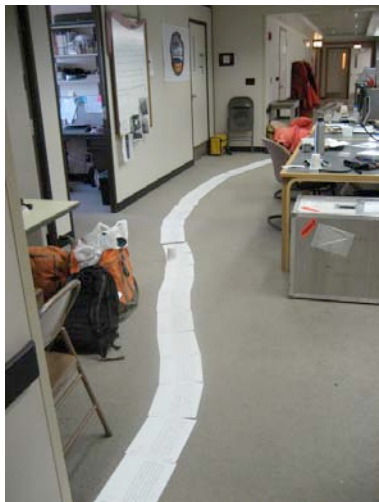
Figure 2. Before having the CoreWall system, scientists use barrel sheets to look at collected data. This picture shows hand-drawn clast core description for 1,000 meters of cores recovered in Antarctica in 2006.